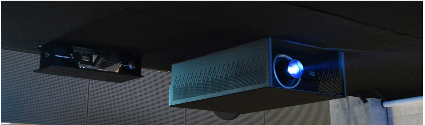
Motorised Mirror Drop (left) comparison- Front view

Featuring DT mounts Position Logic System (PLS) makes it straightforward to set exact stops and closed positions for simple recall via contact closure of RS232.